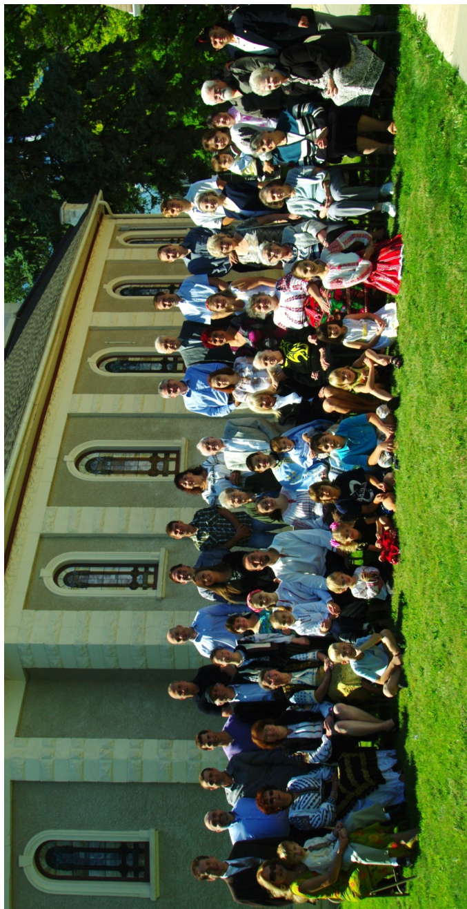
Falling Asleep of Ever Virgin Mary Church, St. Paul, Minnesota