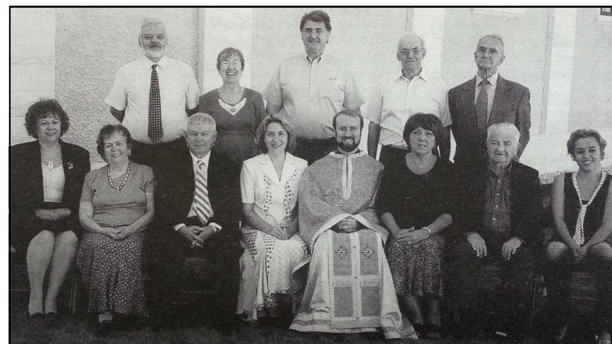
St. Mary's Parish Council - 2004