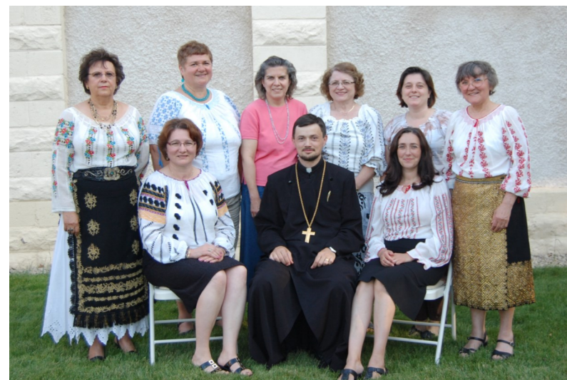
Falling Asleep of Ever Virgin Mary Church, St. Paul, Minnesota ~ Ladies Auxiliary officers ~ 2013