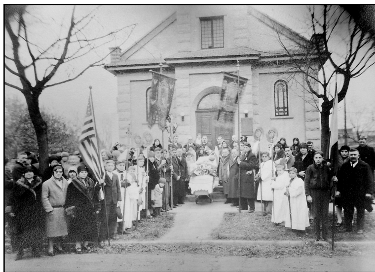
Funeral at St. Mary—circa 1916

It was because their strong Faith that their thoughts were constantly focused on building a church of their own in St. Paul.